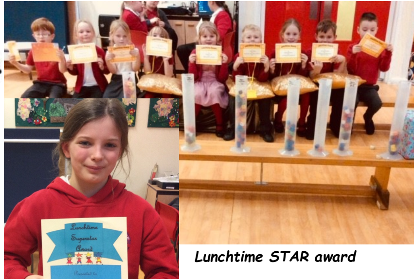
Lunchtime STAR award