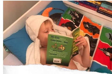
Getting through the 100 recommended books